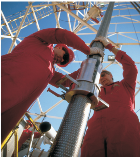
ToughMet® 3 TSI 60U rod is used within the expansion tool for the ESS® system.

Working with Materion Brush Performance Alloys' ToughMet®, Weatherford was able to solve this challenge in their proprietary Expandable Sand Screen (ESS®) system. Constructed of a base pipe, filtration membranes and outer shroud, the system expands when a proprietary tool is pushed from the top down. ToughMet® 3 TSI 60U rod is used within the expansion tool for its high strength, low friction-bearing properties, ensuring ESS components effectively slide to expand for contact with the wellbore, thus providing stability and controlling the influx of sand. With ToughMet® as part of the ESS system, Weatherford reduces completion costs and increases productivity to provide measurable client value in deepwater hydrocarbon wells at depths of up to 18,000 feet.